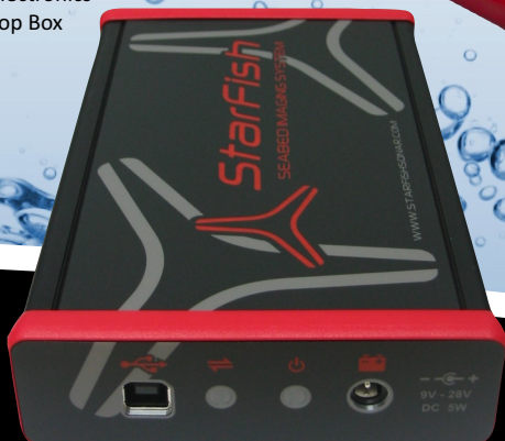
StarFish 990 Electronics Top Box