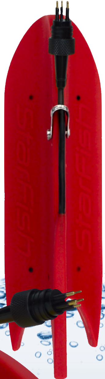
StarFish 990F Towed Sonar Head

Measuring less than 15 inches long the StarFish 990F sonar is small enough to be transported in your rucksack. Lightweight and quick to deploy by hand, the 990F towed system is independent of the boat requiring no fixed installation which makes it easy to transport and operate from any vessel. The StarFish Peli Case provides a rugged and watertight method for transporting and storing your StarFish system.